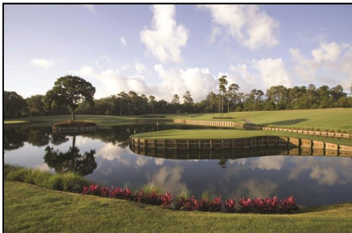
TPC Sawgrass – THE PLAYERS Stadium Course